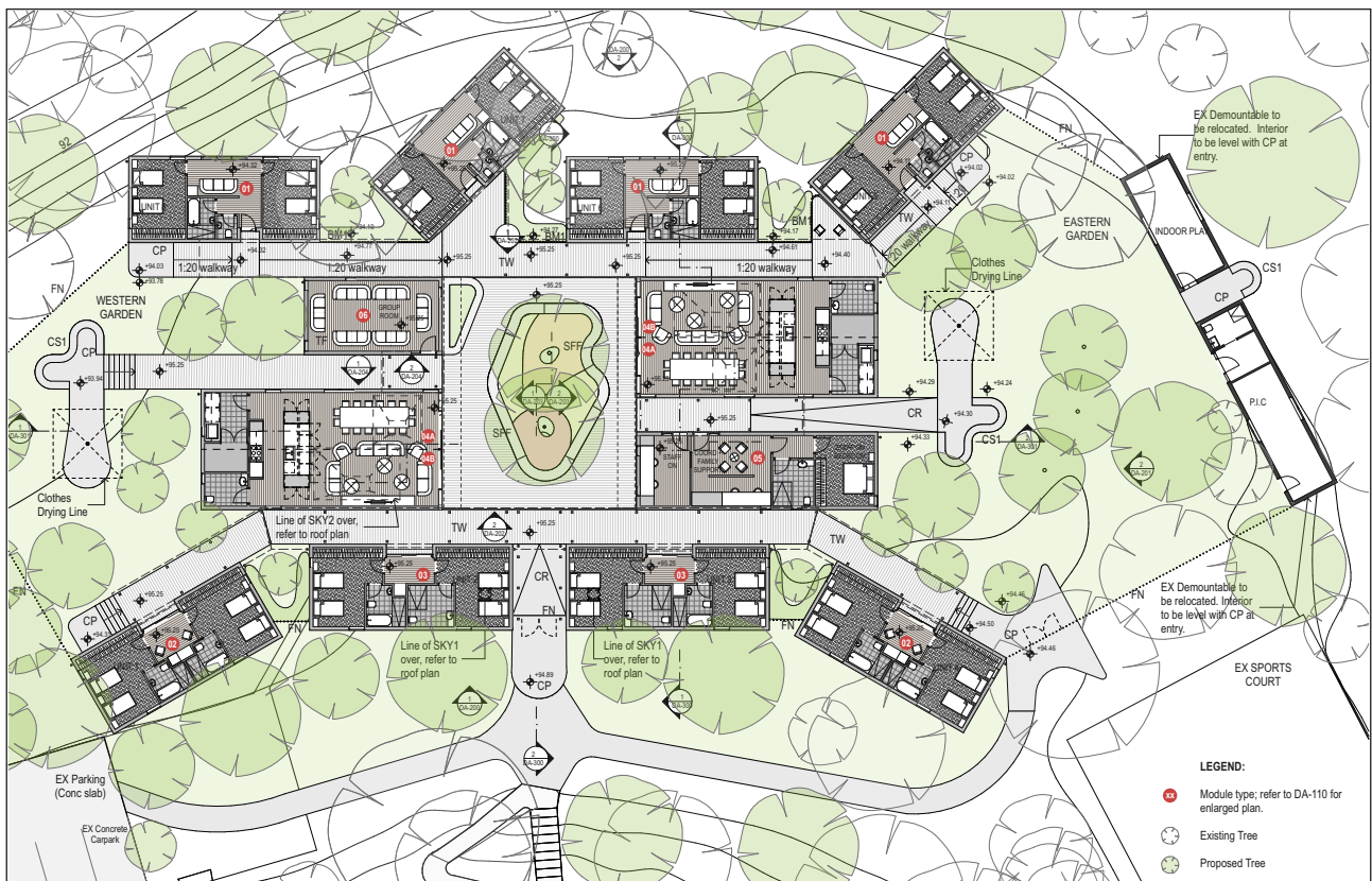
Architect's design of the Parent's and Children's Program accommodation

Our new facility underpins our commitment to building safe and healthy communities.