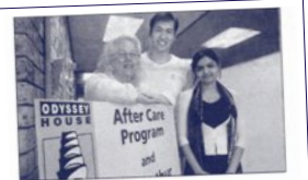
MacArthur Chronicle, Tuesday October 21, 2008