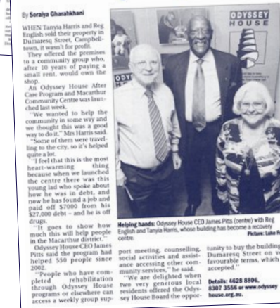
Campbelltown Macarthur Advertiser, Wednesday October 1, 2008