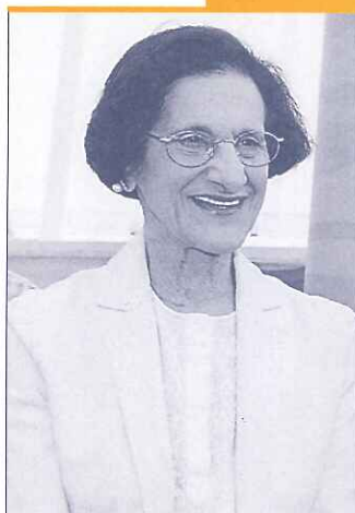
Her Excellency Professor Marie Bashir AC, Governor of NSW.

Please offer your financial support to Odyssey House this Christmas. Your assistance will enable us to help other young adults overcome their terrible battle with addiction and have something to smile about. Your generosity is greatly appreciated.