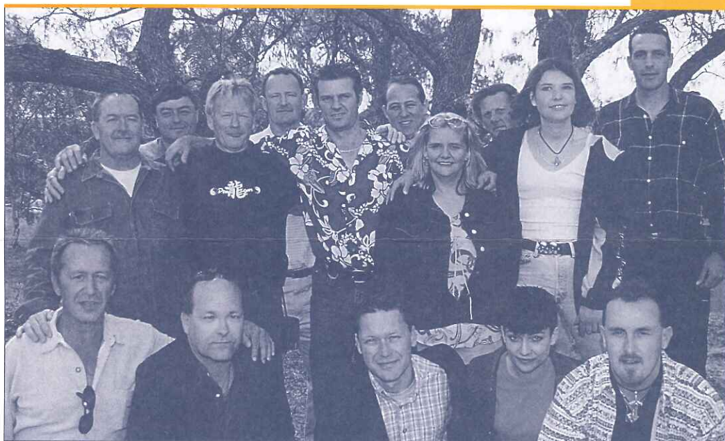
We made it! Residents who graduated from Odyssey House in 2002.

Special guest, Her Excellency Professor Marie Bashir AC, Governor of NSW, personally congratulated the thirteen men and four women that officially graduated from the program during the Odyssey House 25th silver anniversary celebrations held recently.