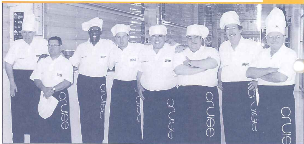
Our celebrity chefs get ready to cook.