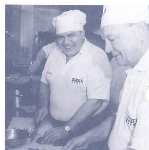
Businessmen John Symond & Gerry Harvey hard at work in the kitchen.