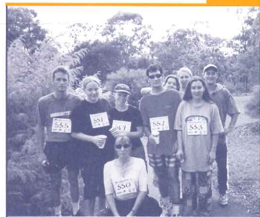
The Odyssey House contingent getting ready for the Mt Annan Fun Walk