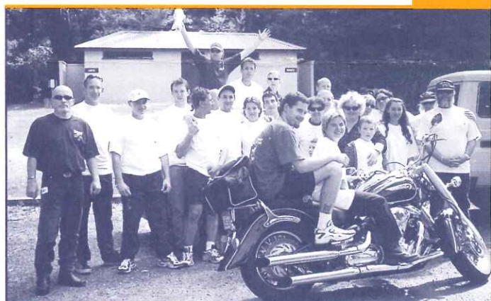
Odyssey staff and residents relax at the National Park

The riders made their way from McDonalds Family Restaurant in Narellan, on Camden Valley Way through Wollongong and the Royal National Park where they met at Audley Weir. It was here that everyone disembarked for a well deserved sausage sizzle and luncheon.