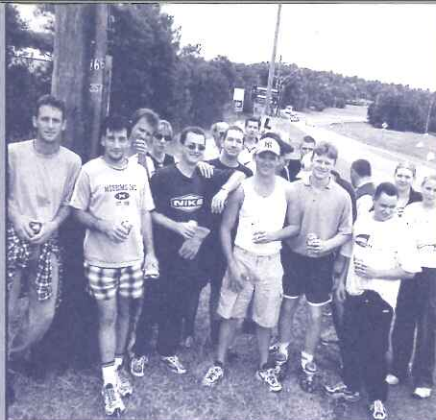
Odyssey House residents do their bit on 'Clean Up Australia Day'

from Raby Road overpass to Harbord Road, Leumeah. Over 50 bags of rubbish were collected by the Odyssey crew