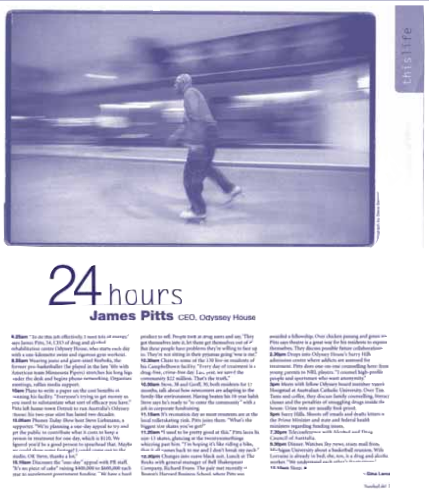
The Sun-Herald Magazine - 26th August 2001

Odyssey House regularly receives public recognition and support from the media in its commitment to helping people with drug, alcohol and gambling problems overcome their addictions. Here is a sample of news features that have appeared on Odyssey House over the last few months.